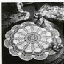
TABLE CENTER "ANDROMEDA"